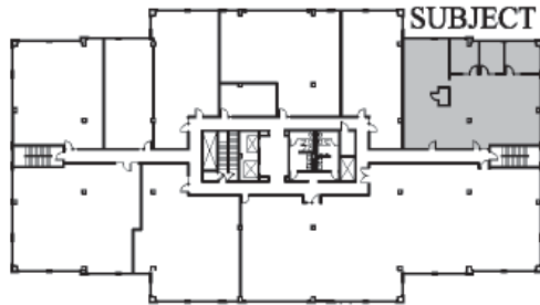
BUILDING KEY NOT TO SCALE