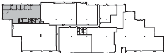
SUBJECT BUILDING PLAN