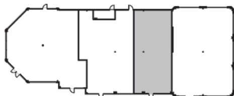
SUBJECT BUILDING PLAN